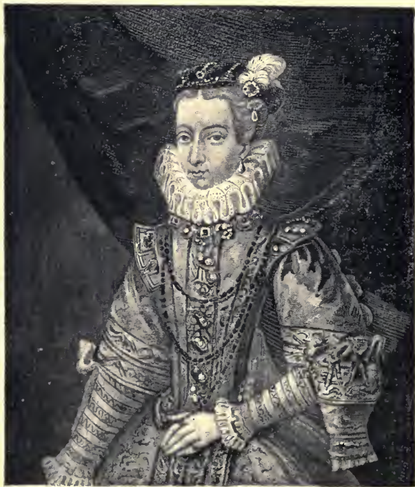
ANNE OF AUSTRIA.